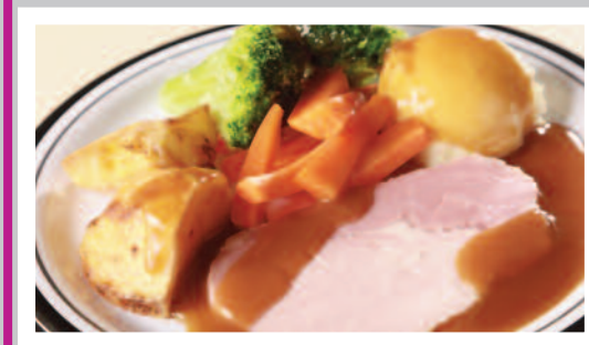
Honey Roast Gammon served with Roast/Mashed Potatoes. Seasonal Vegetables & Gravy