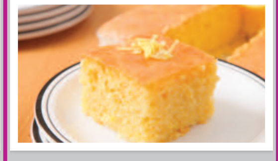
Lemon Drizzle Cake