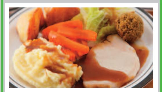
Roast Pork served with Roast/Mashed Potatoes. Seasonal Vegetables & Gravy