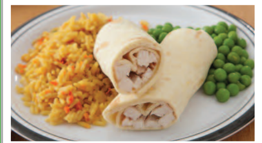
Chicken Fajitas served with Rice and Seasonal Vegetables